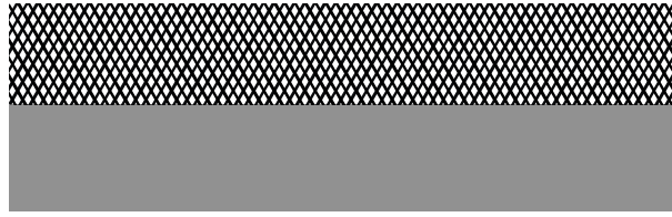
(a) Frank-van der Merwe (FM)